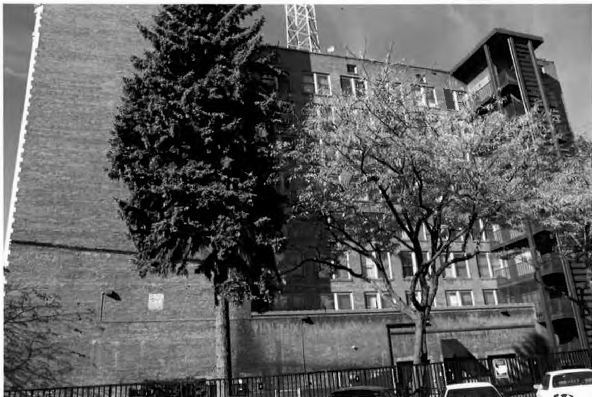
Photo 4 East face windows of Realty Building in 2014 (NPS-approved window replacements)

Photo 3 East face of Realty Building in 2014