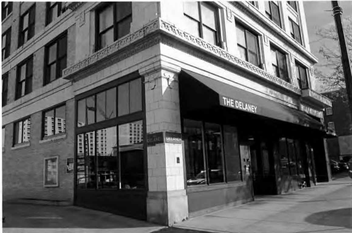
Photo 9 Southwest corner façade in 2014 Photo 10 Southeast corner façade in 2014