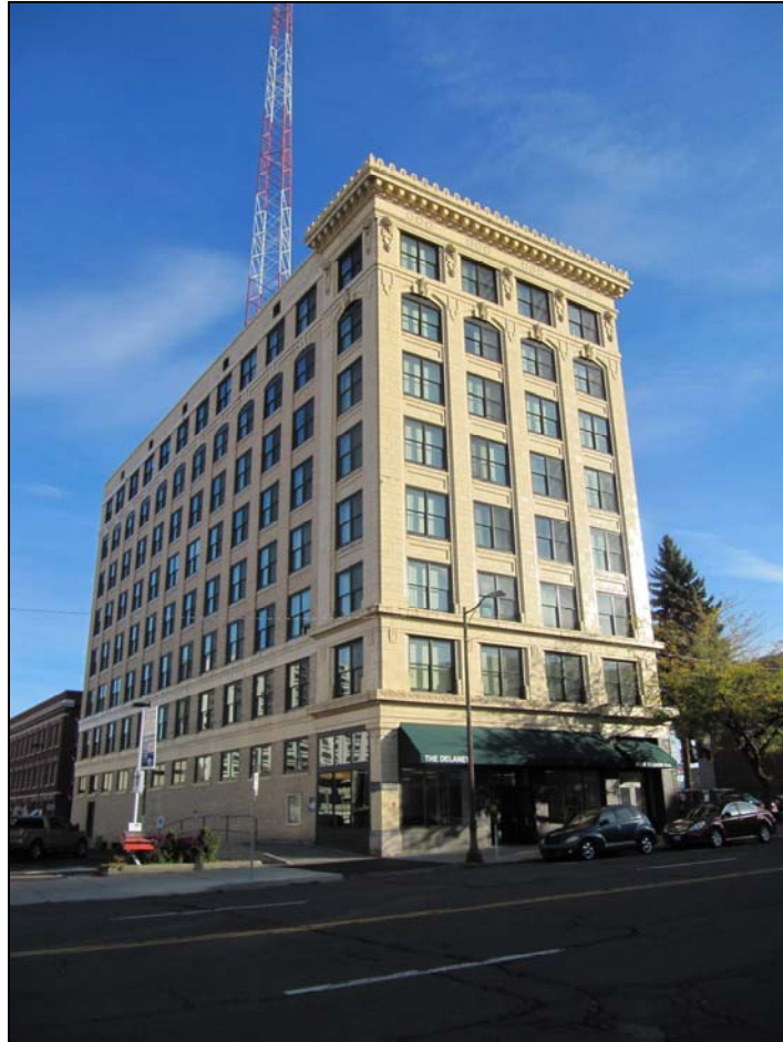
Realty Building in 2014