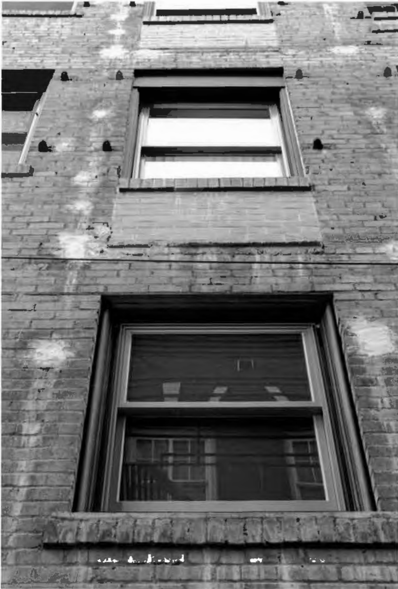
Photo 7 NPS-approved window replacements in 2014, rear north face of building Photo 8 Rear north face of Realty Building in 2014 (facing alley)