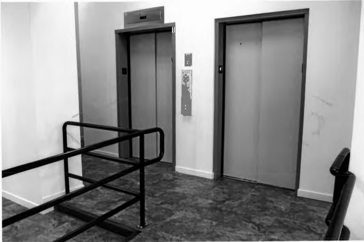
Photo 14 Fourth-floor hallway in 2014, looking north (representative of 7 floors above streetlevel)