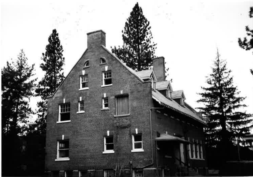
Photos 8 and 9 SW elevation.