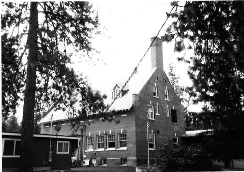
Photos 1 and 2 Spokane Parental School facade.