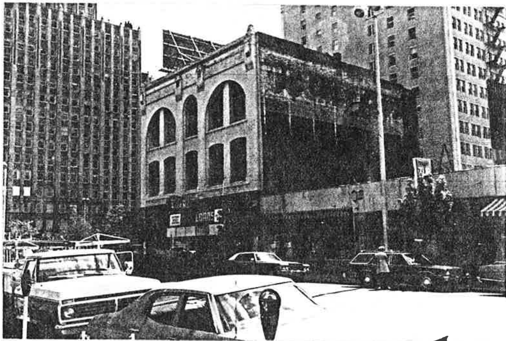
Looking southwesterly across Washington Street at the northeast corner of subject. The Paulsen Office Building looms at left. The Old National Bank Office Building at right. A series of small stores/shop adjoin subject to the north.