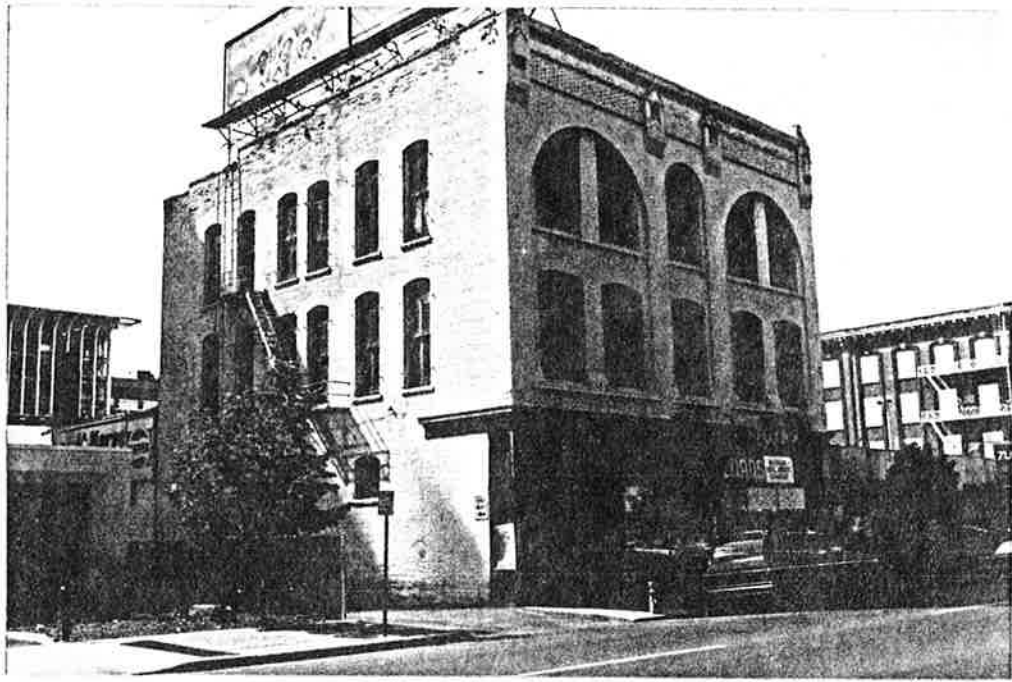
Looking northwesterly across Washington Street at the southeast corner of the subject. Alley adjoins property on south, then drive-in banking facility.