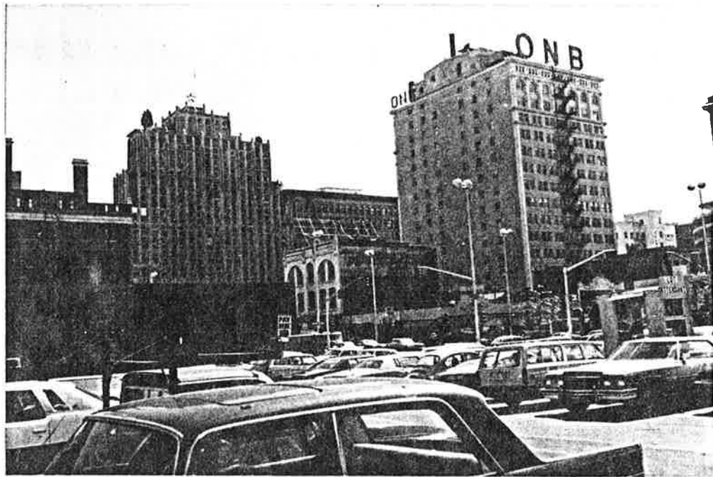
A more distant view of the subject looking southwesterly. The Paulsen and Old National Bank Buildings loom above the subject.