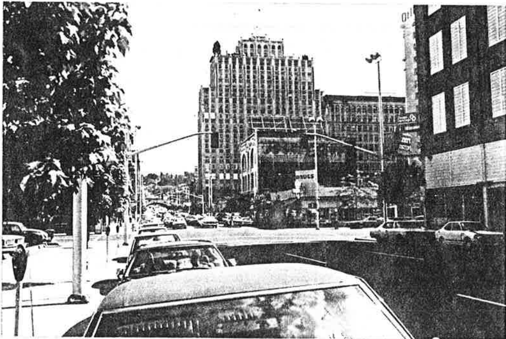
View looking southerly along Washington Street, across intersection with Main Avenue.