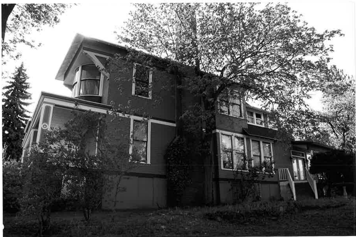
PHOTOS 3 and 4 West elevation (top photo) and east elevation in 2009.