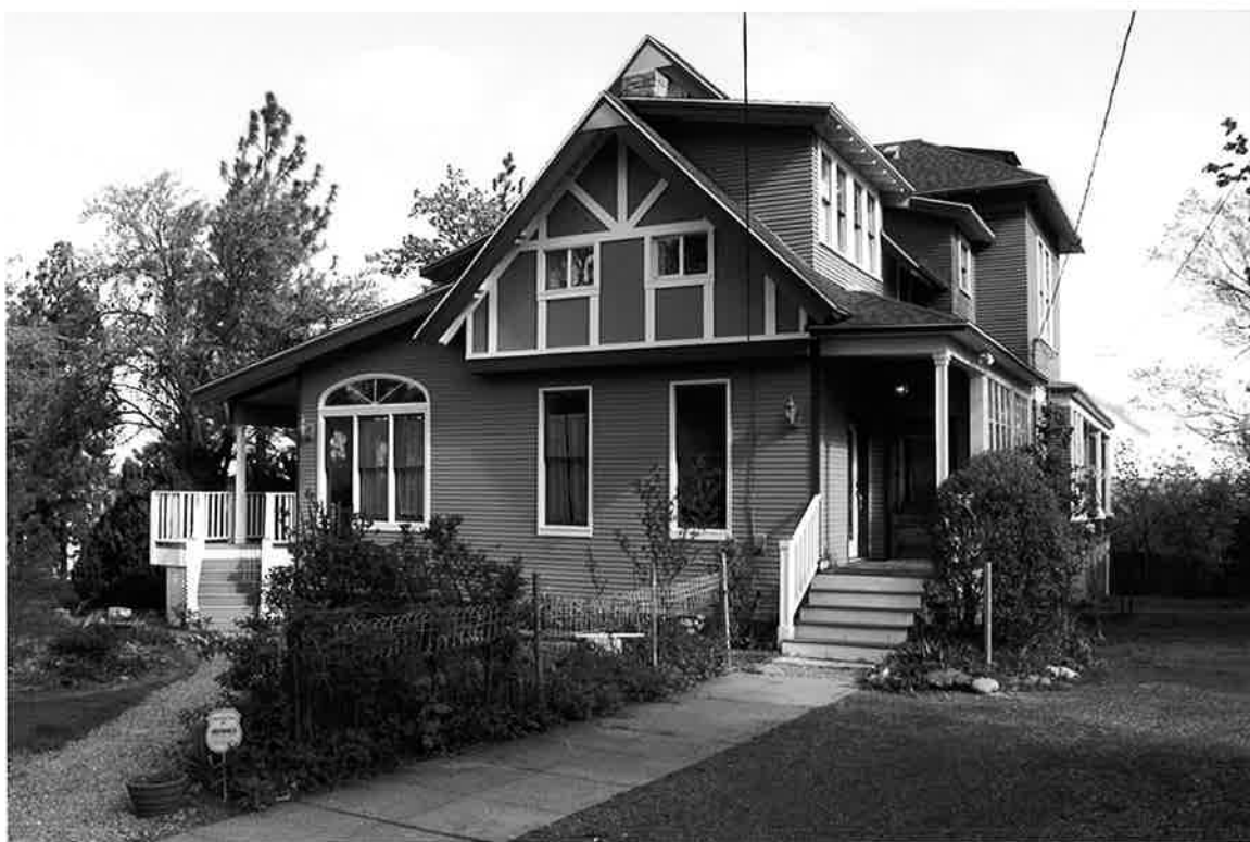
PHOTOS 5 and 6 South rear elevation of house and detached garage in 2009.