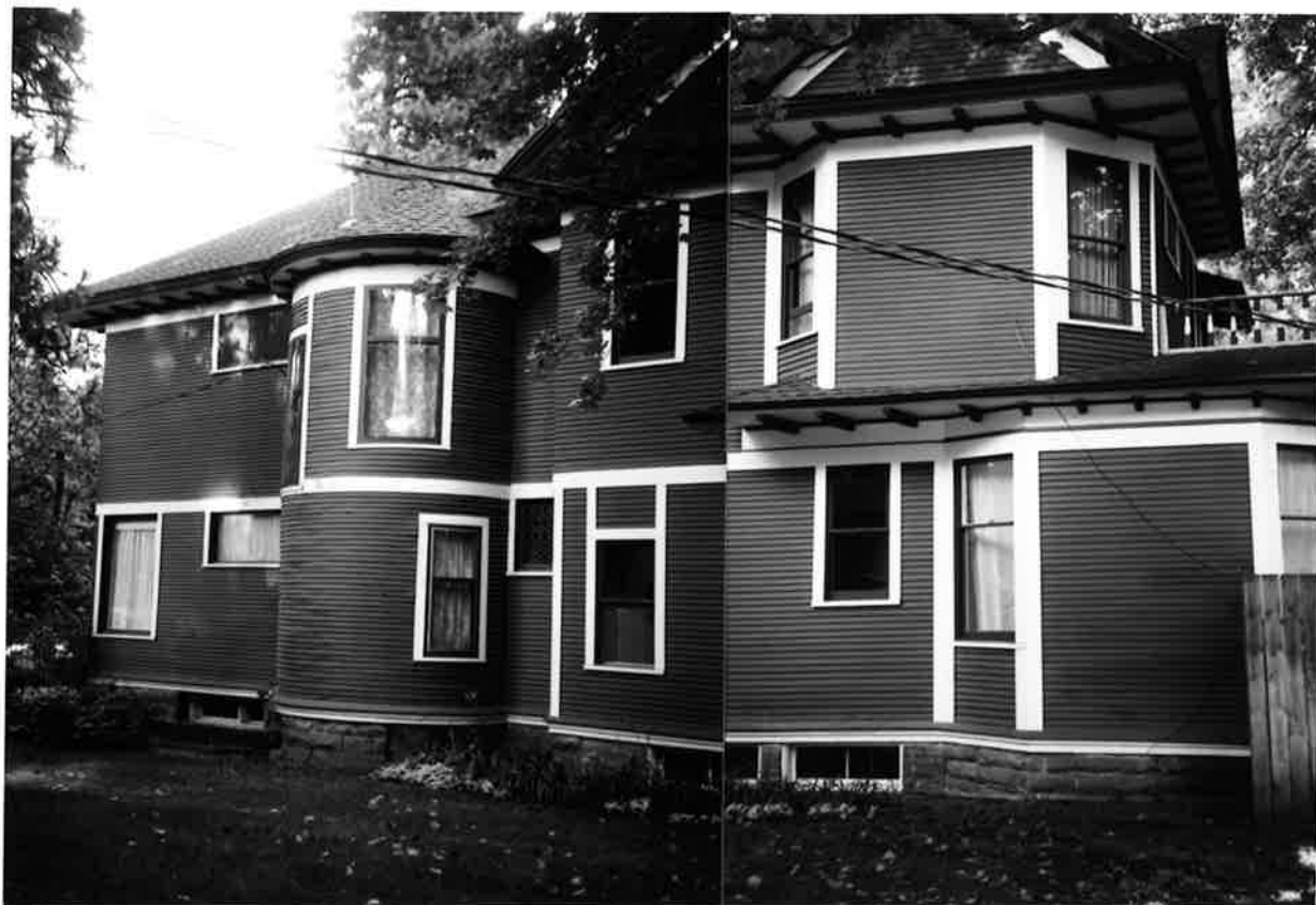
West elevation of house in 2004.