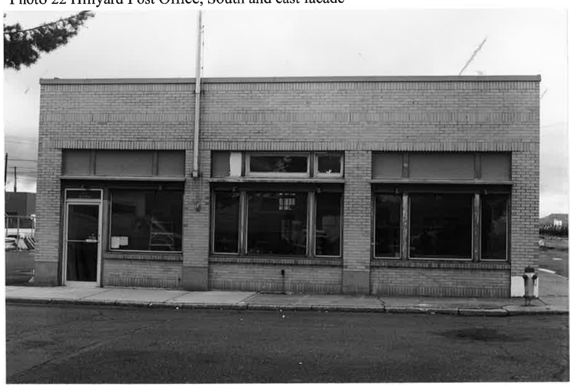
Photo 21 Hillyard Post Office, South facade Photo 22 Hillyard Post Office, South and east facade