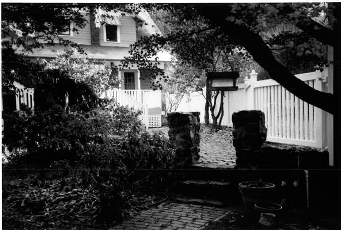
Photos 18 and 19 Grounds behind house in 2006.