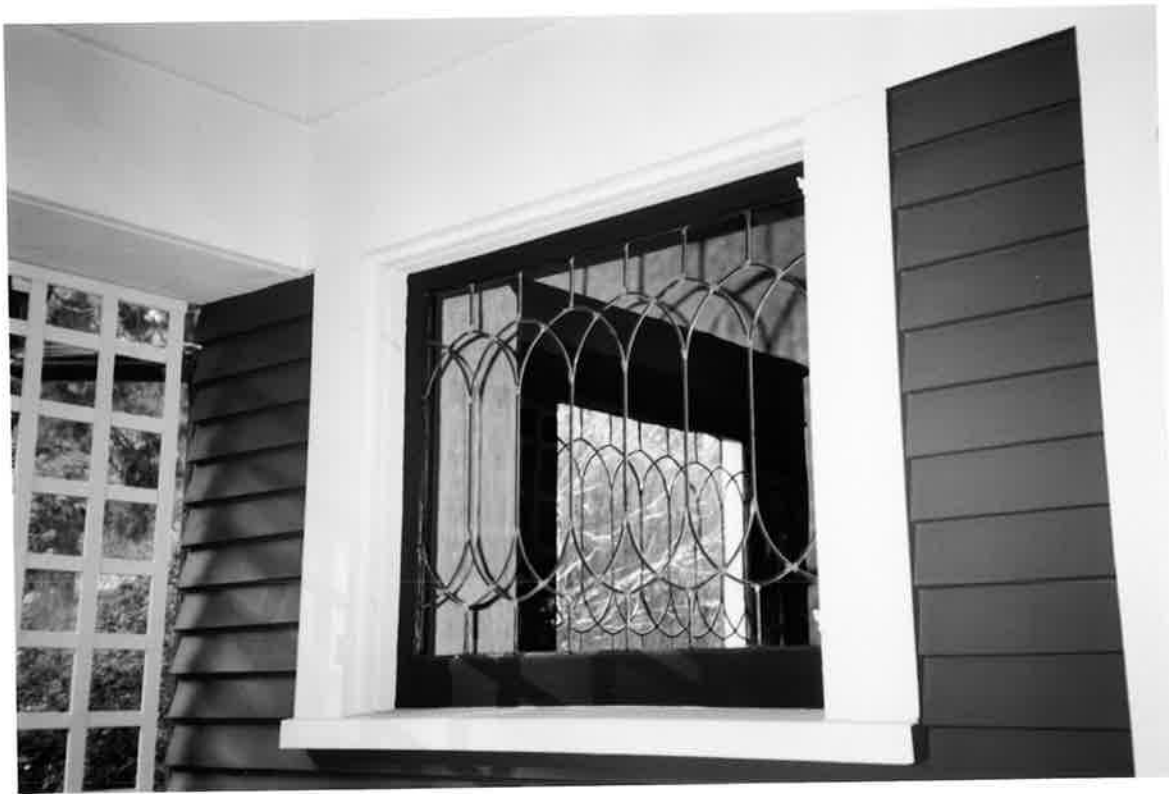
Photos 3 and 4 East façade details of house in 2006.