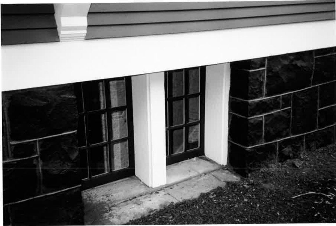
Photos 13 and 14 Foundation details in 2006.