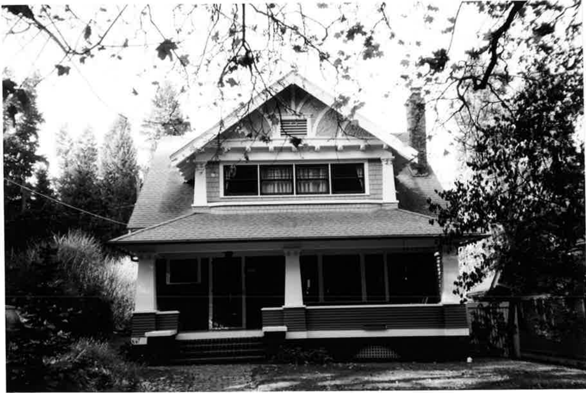
Photos 1 and 2 East façade of house in 2006.