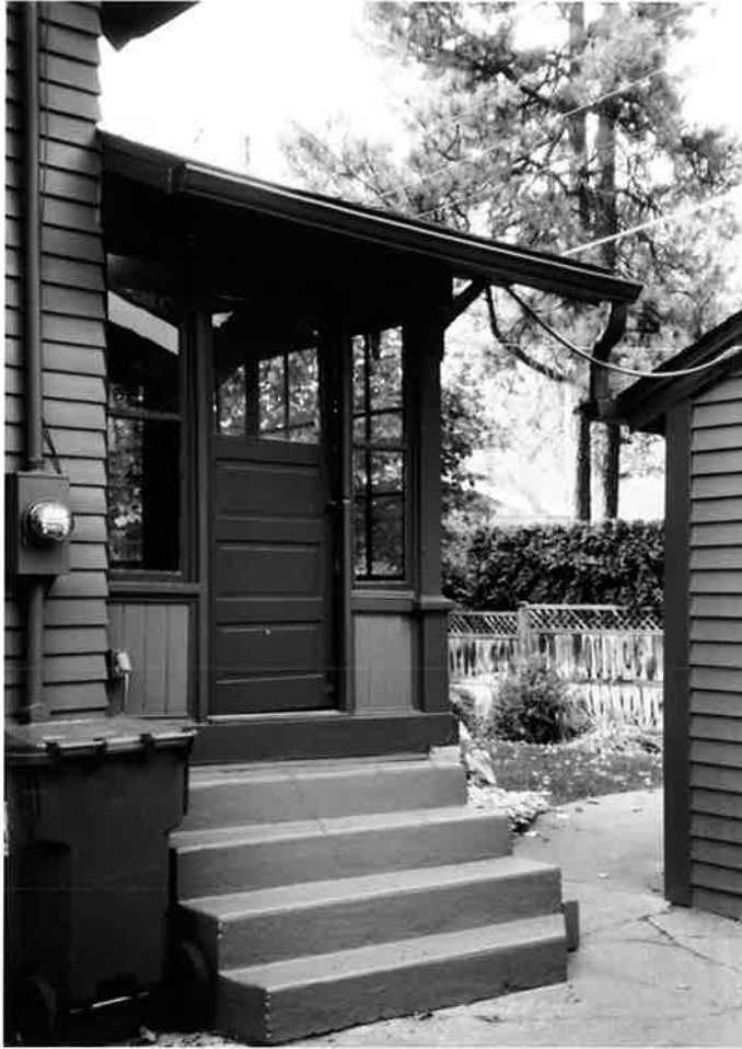
Photos 10 and 11 East elevation of house and garage.