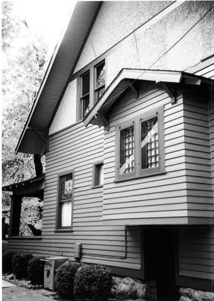
Photos 8 and 9 East elevation of house.