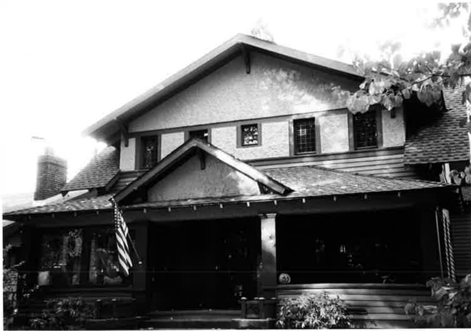
Photos 3 and 4 South elevation of house.