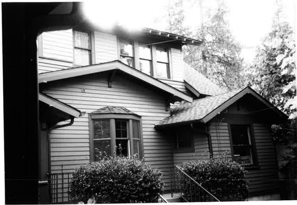
Photos 13 and 14 Rear, north elevation of house.