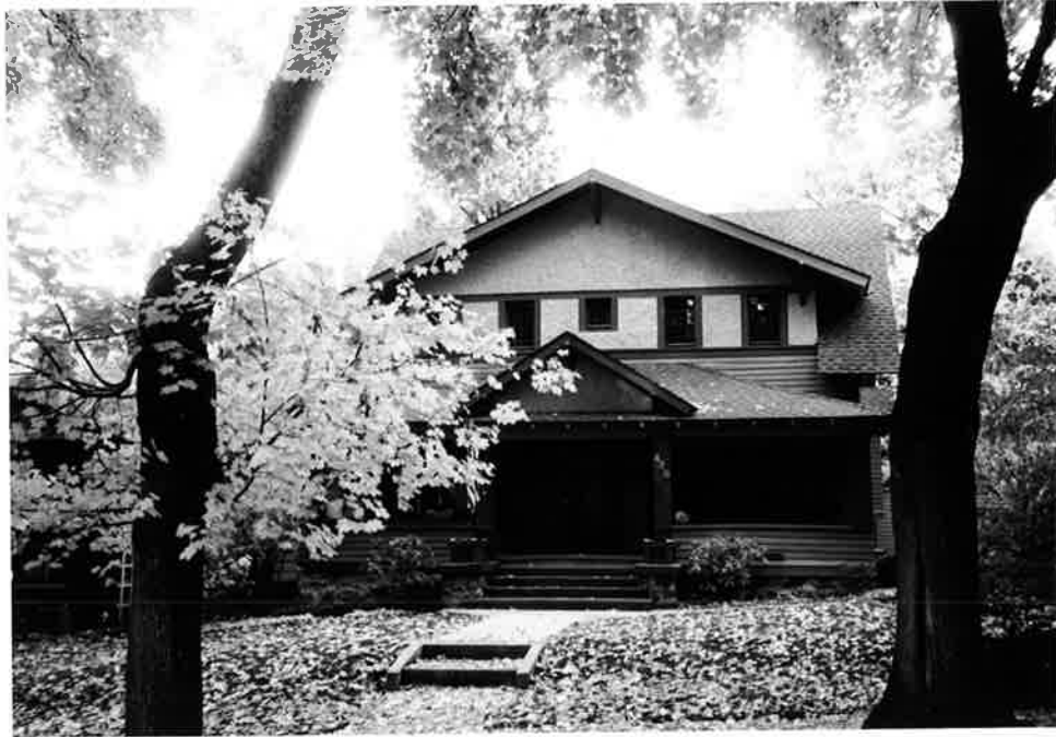
Photos 1 and 2 South elevation of house.